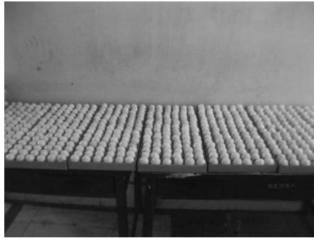
Fig. Storage of eggs