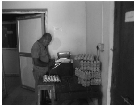
Fig. Candling of egg

Candling is a process to assess for the internal quality of the hatching egg and the embryonic development inside the egg. It is done through using an electric bulb and placing the egg against the light. On 7 th day of incubation, eggs are tested for the fertility. In a fertile egg, embryo is visible near the air cell as a dark spot at the large end of the egg and blood vessels radiating from it. A dead embryo generally stuck with the wall of the shell and no radiating masses of blood vessels. The infertile eggs are always clear in appearance. The eggs containing embryo again candled at 24- 25 th day of incubation