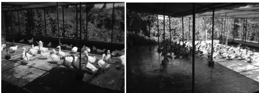
Fig. Rearing of White Pekin and Khaki-Campble under intensive housing system

Feed should be provided in the feeders and should be at the level of body so there will be less spillage and subsequently feed will be free from contamination of droppings. The space requirement for the duckling till 21days is 4 cm.