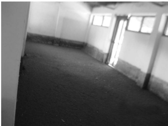
Fig. Management under deep litter system

The yard should be clean and free of any holes, through which any predators can reach to the ducks and affects the production and productivity of the ducks either by losing of ducks or eggs. The dirty yards also invite multiple infections to the ducks as they are the reservoirs of multiple type of organism. It should be little sloppy so that water should not get stagnated in any place.