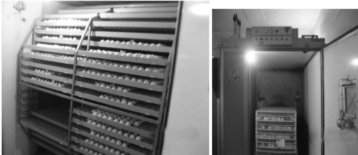
Fig. Setter and Hatcher for artificial incubation of eggs