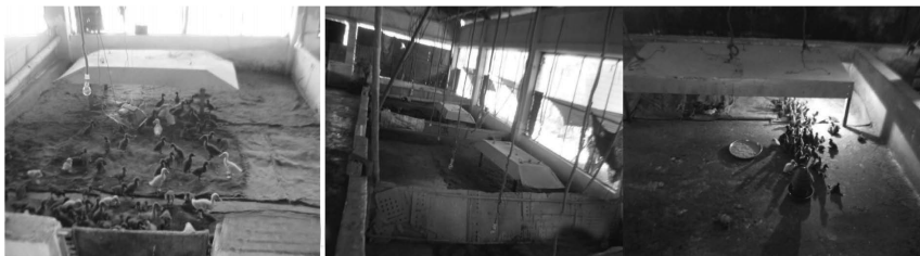
Fig. Ducklings Rearing in the Brooder House

On the first week, the temperature of the brooder should be 30°C and gradually has to reduce by 3°C per week till third week of age. Removal of brooder is totally depending upon the climatic conditions of the surroundings area.