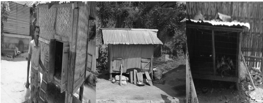
Fig. Traditional Duck Rearing System

In villages, the farmer usually made their house by locally available materials. They generally never build permanent shelter house except few progressive farmers. The shelter houses are mainly constructed by using the bamboo and wood. Farmers kept the height of the shelter house at a height of 1.5 to 2 feet from the ground level that protects ducks from the harsh climate, predators. Farmers are with small flock size, generally kept under the bamboo made basket during the period of night.